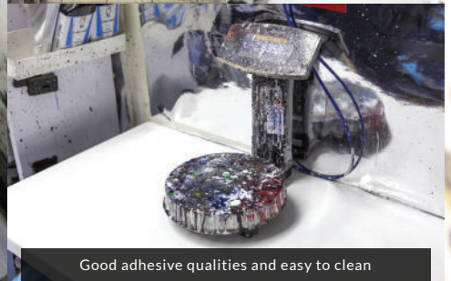
Good adhesive qualities and easy to clean