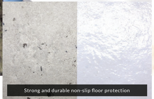
Strong and durable non-slip floor protection